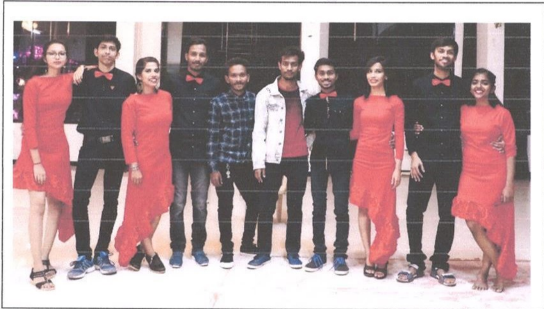
Photo 1 Fashion day

Date of program:13/02 /2018 to 17/02 /2018