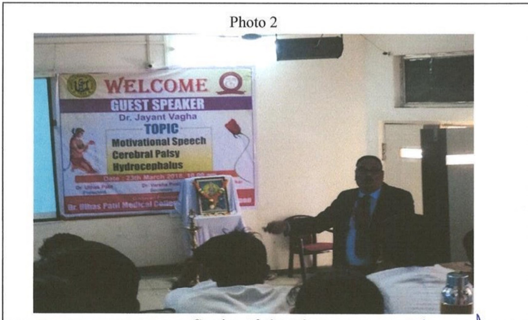
Caption of photo 2: