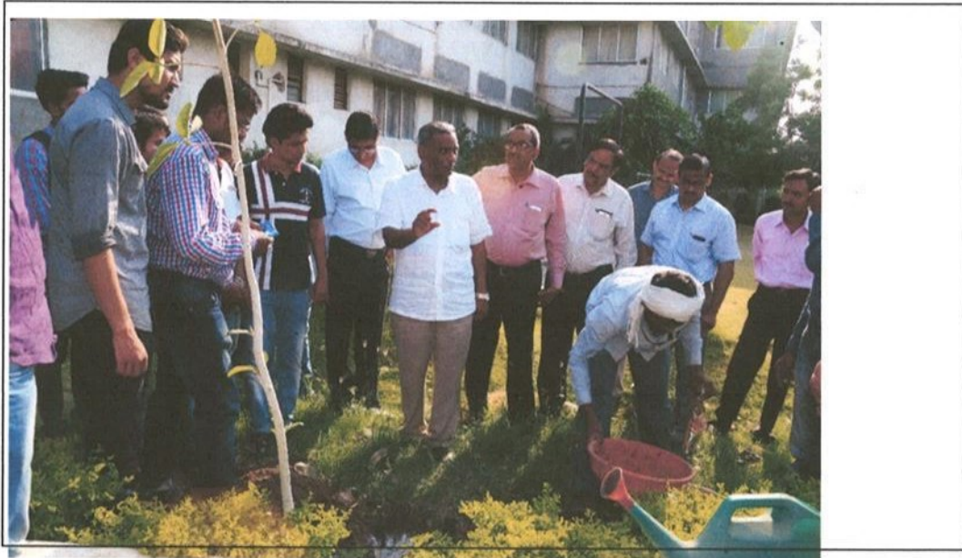
Caption of photo 1: