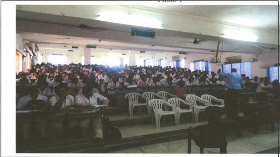
Caption of photo 1: